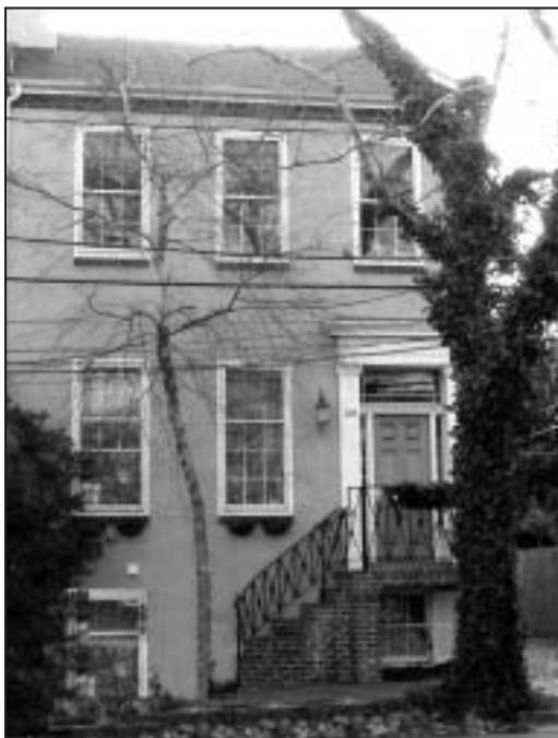
EREF's new home